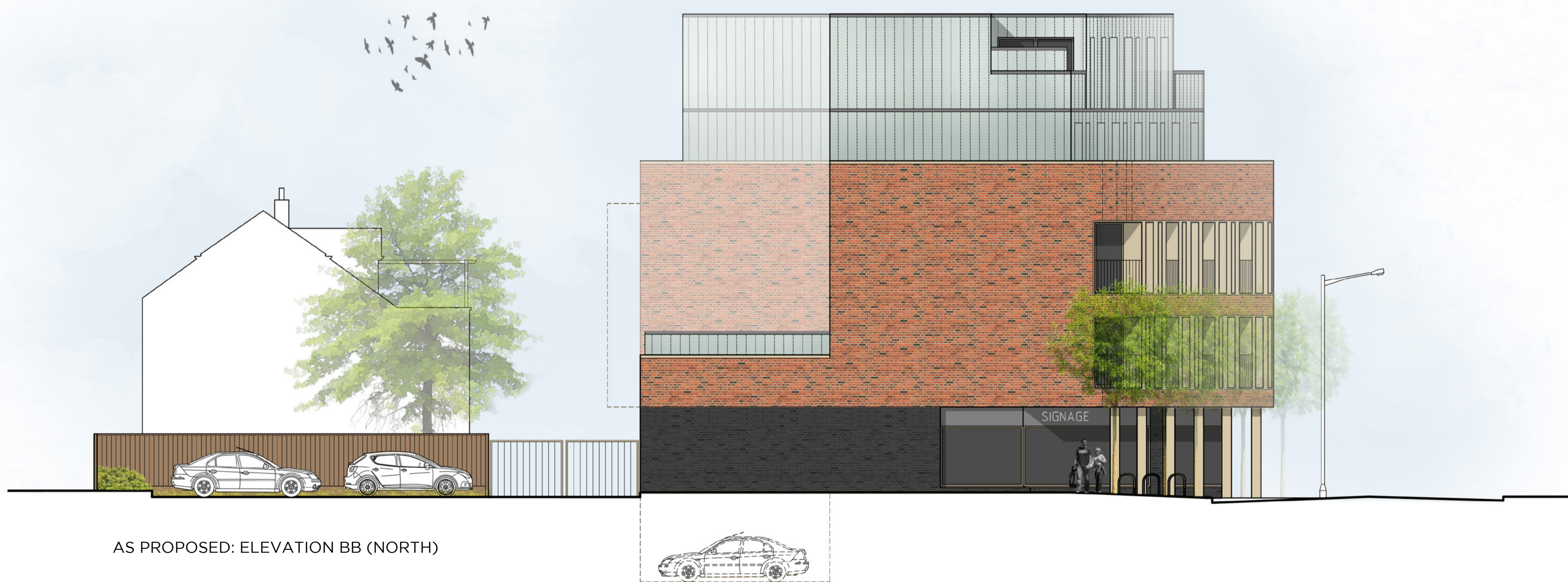
AS PROPOSED: ELEVATION BB (NORTH)