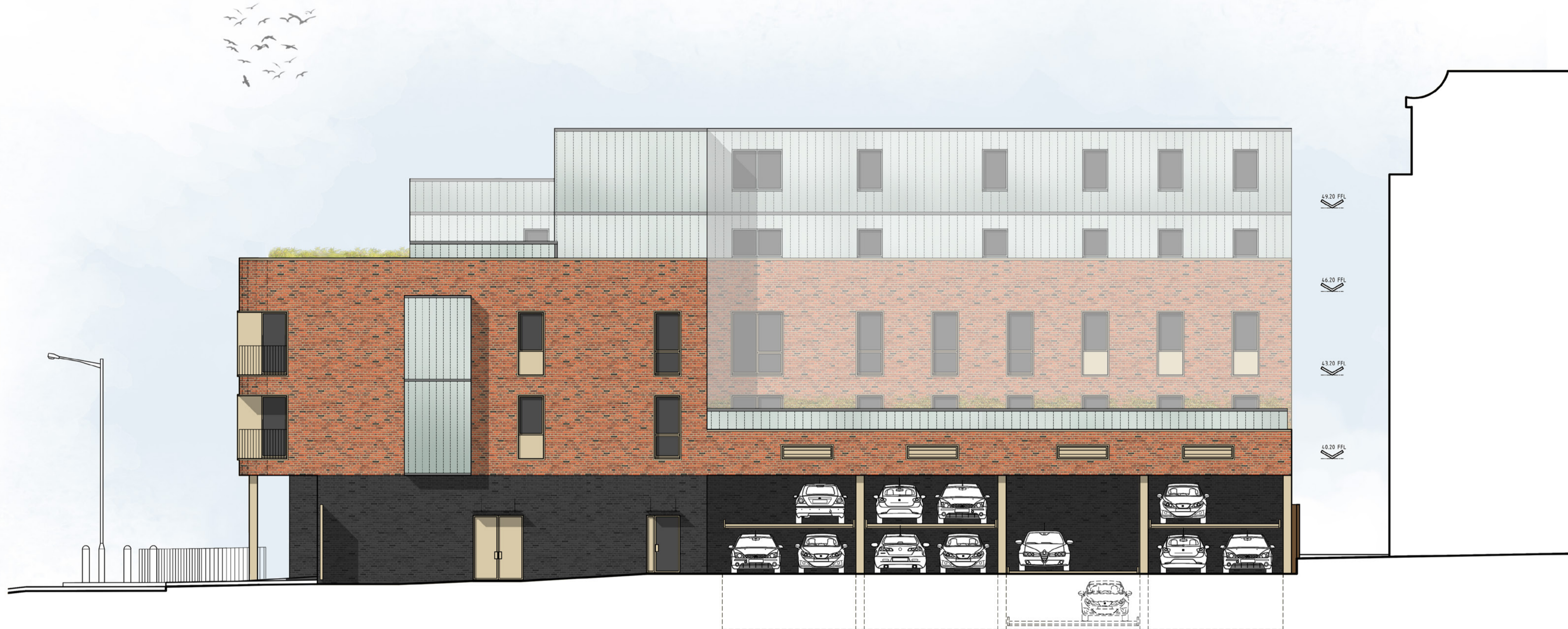
AS PROPOSED: ELEVATION AA (EAST)

GENERAL NOTES The copyright in all designs, drawings, schedules, specifications and any other documentation prepared by DAP Architecture Ltd. in relation to this project shall remain the property of DAP Architecture Ltd. and must not be reissued, loaned or copied without prior written consent. Do not scale from this drawing, use figured dimensions only. Prefer larger scale drawings. All dimensions are in millimeters (mm) unless otherwise noted. Check all relevant dimensions, lines and levels on site before proceeding with the work. This drawing is to be read in conjunction with all Architect's drawings, schedules and specifications, and all relevant consultants' and/or specialists' information relating to the project. Refer all discrepancies to DAP Architecture Ltd.